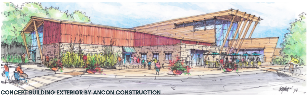
CONCEPT BUILDING EXTERIOR BY ANCON CONSTRUCTION

Elkhart County Parks contracted with Boyle and Associates to begin a FUNDRAISING FEASIBILITY STUDY for the future Ox Bow Museum of History and Nature. The study will assess the community's capacity to support a capital campaign. Results are expected in 2020.