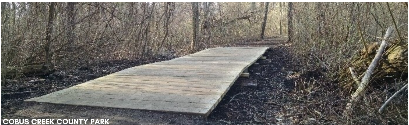
COBUS CREEK COUNTY PARK

Eagle Scout NOAH HAAS FROM TROOP #122 resealed the ceiling woodwork on the Cobus Creek County Park pavilion and completed trail upgrades throughout the park.