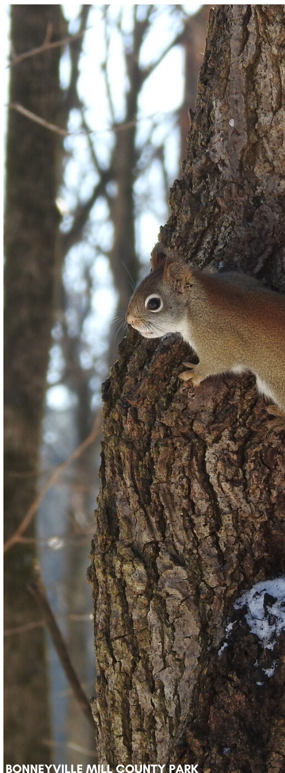
BONNEYVILLE MILL COUNTY PARK