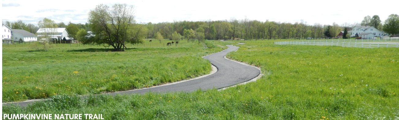
PUMPKINVINE NATURE TRAIL

An important segment of the Pumpkinvine Nature Trail was completed in 2019 that increased the safety of the trail by removing users from the roadway. The TRAIL BETWEEN COUNTY ROAD 33 AND COUNTY ROAD 20 opened the day of the Pumpkinvine Bike Ride and traverses through SCENIC WETLANDS AND PASTURE . A special thank you to the Friends of the Pumpkinvine Nature Trail, Community Foundation of Elkhart County, Indiana Department of Natural Resources, and the donations of many individuals and corporate sponsors for partnering to accomplish this project.