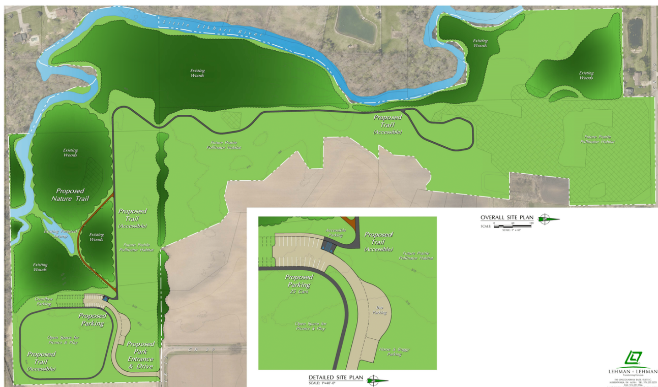
CORSON RIVERWOODS COUNTY PARK SITE PLAN

Corson Riverwoods County Park was pre-awarded a $250,000 LAND AND WATER CONSERVATION FUND GRANT to establish a trail and parking lot at the future 75 acre park. Funds will be awarded by the National Park Service in 2020 and will be matched by the gift of the land from the late Thomas Corson.