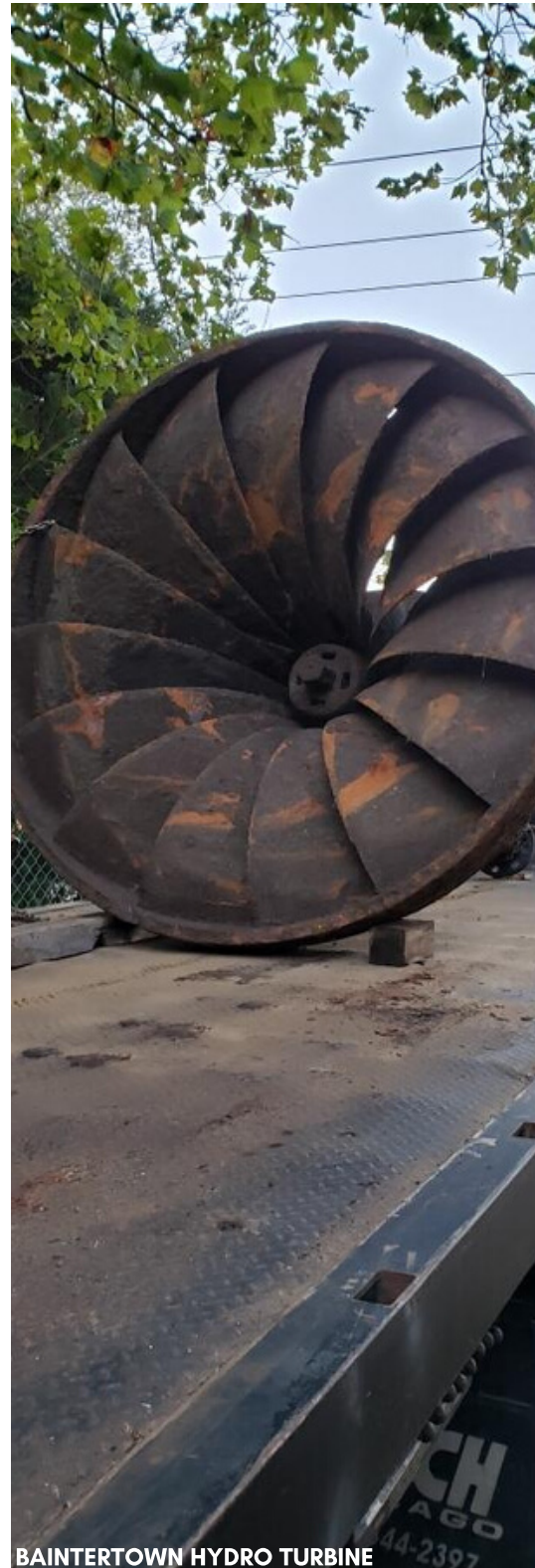
BAINTERTOWN HYDRO TURBINE

Nearly a mile of new burn break was created at Boot Lake Nature Preserve. Burn breaks function as a hiking trail and help protect the prairie during future burns.