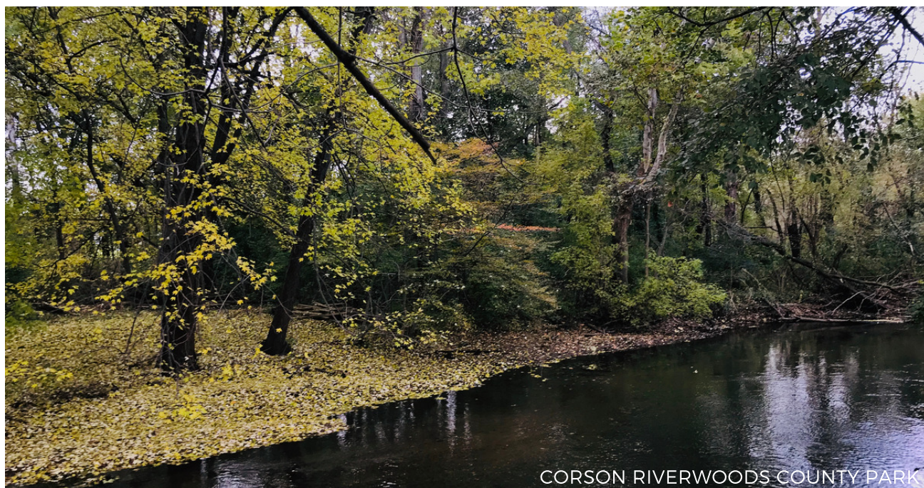
CORSON RIVERWOODS COUNTY PARK