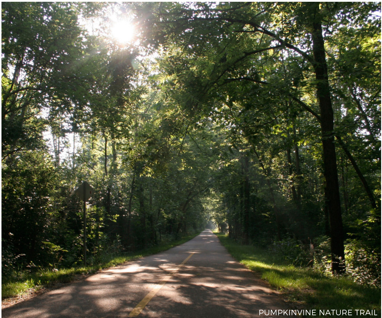
PUMPKINVINE NATURE TRAIL

Major work on the PUMPKINVINE NATURE TRAIL GAP Phase I began in the fall of 2018, with an expected completion date in mid-2019. This .8 mile extension of the trail is a small but important project as it moves bike traffic off of county roads and onto the safety of trails.