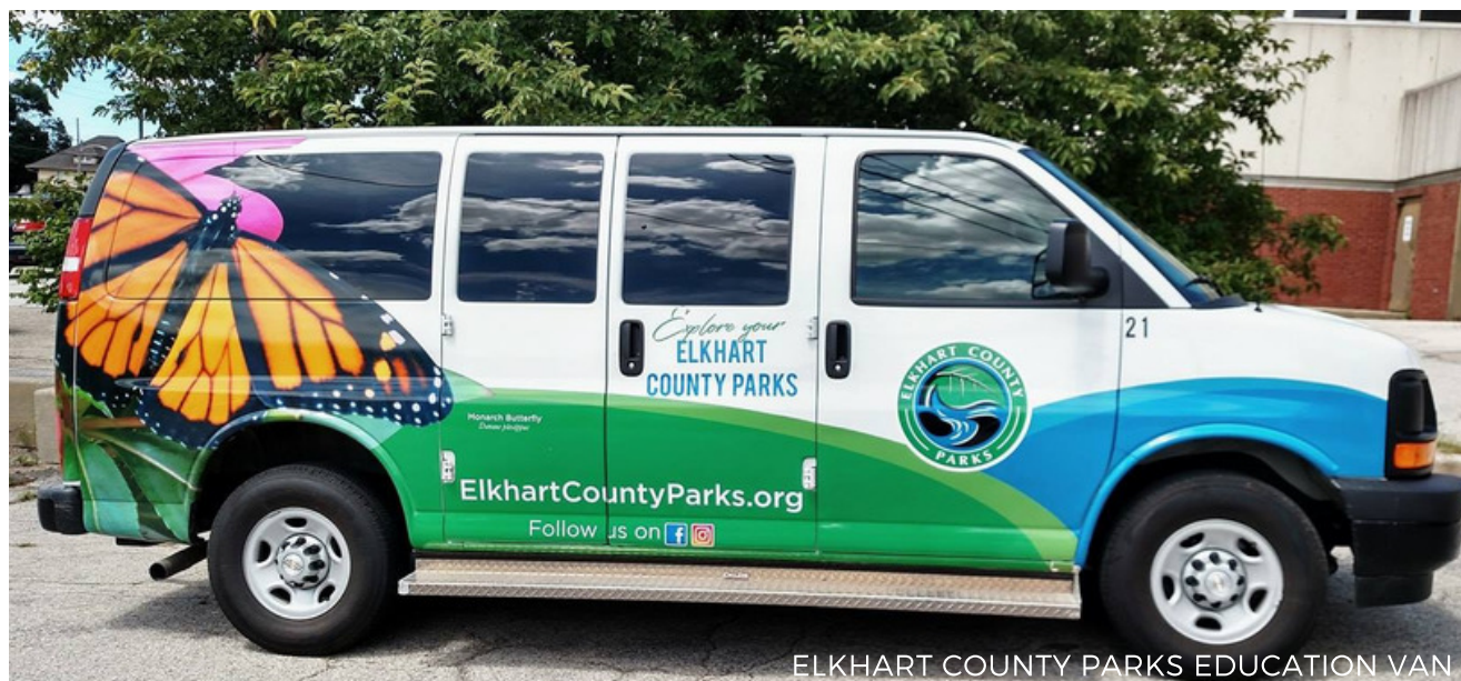
ELKHART COUNTY PARKS EDUCATION VAN

Several NEW VEHICLES were purchased for the department including a new education van for programs and school visits. The education van was enhanced with a colorful wrap featuring several local native species of animals. Staff showcased the van in the annual 2018 4-H Fair Parade. A special thank you to the Friends of the Elkhart County Parks and ZWrapz for sponsoring the wrap.