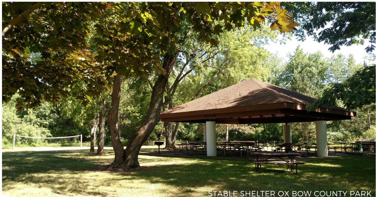
STABLE SHELTER OX BOW COUNTY PARK

The Community Foundation of Elkhart County granted the Elkhart County Parks with a $5,000 gift to be used towards programs and events in 2018-2019. The grant allowed the department to expand the capacity of programs and number of people reached through increases in marketing, purchasing quality supplies, and enhancing special events.